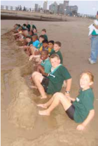
Waiting for the big wave to come... Yes, they got wet!!